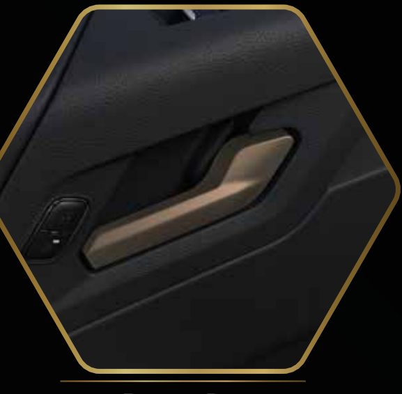
Bronze Door Handle