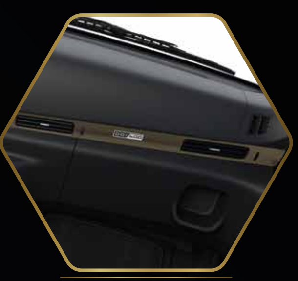
Bronze Decopart & Select Serial Number