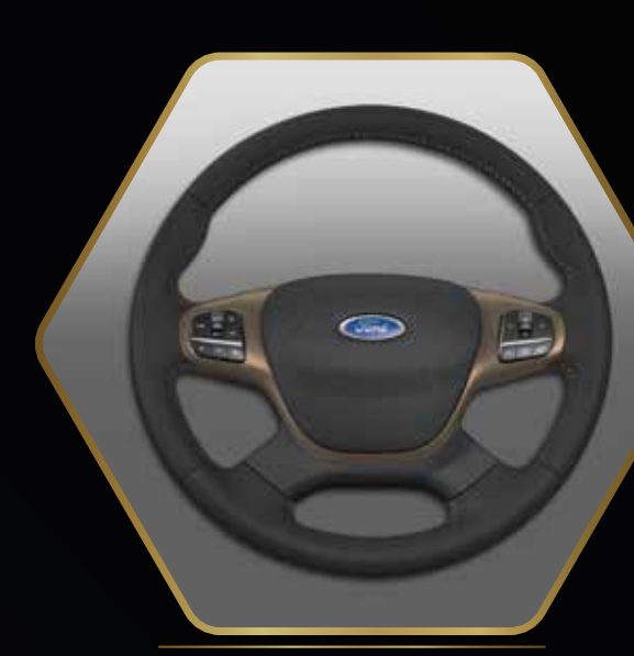
Steering Wheel with Bronze Details