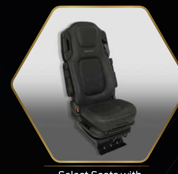
Select Seats with Bronze Details